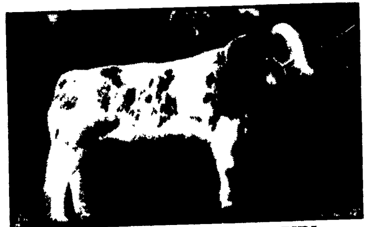
COURAGE, A BELGIAN BLUE BULL

Low Fat, Low Cholesterol, Good Taste Excellent for Crosses to Beef or Dairy Cattle Selected for Calving Ease, High Yield