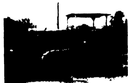
Caterpillar D7 Crawler Dozer, Runs & Operates Undercarriage 75% $4,625 00