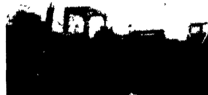
Hancock D282 Self Loading Pan V. Good Condition $12,000 00