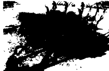
Landoll, 15 Shank Slicer Chisel, 18" Slicers, Buster Bar Finisher (T3274)