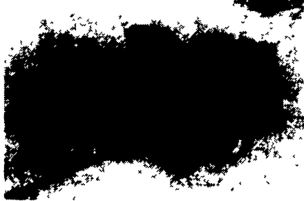
White, 18' Manual Fold Disc, 7 1/2" Spacing, Blades - 18" Front, 17" Rear (T3321)