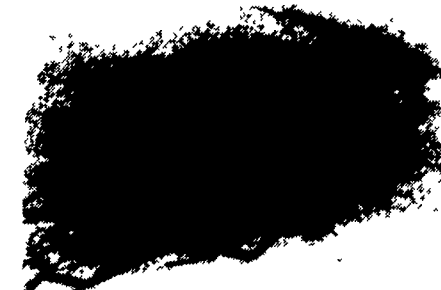
Landoll, 7 Shank Slicer Chisel, 11Lx15 Tires (T3504)