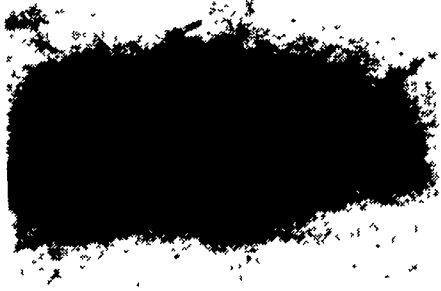
IH 501 Disc, 14' Cut, 10 1/2" Spacing, 21" Blades, Buster Bar Drag (T3283)