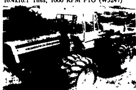
Minneapolis-Moline Model 1600 4WD, Diesel, Dual 18.4x34 Tires, Cab (W3389)