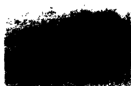
Hutchmaster, 10' Offset Disc, 10 1/2" Disc Spacing, 22" Disc Front, 26" Discs Rear (T3502)

It Takes A Tractor This Good To Earn A Warranty This Good