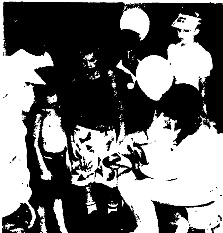
Youngsters learned about snakes at the Shaver's Creek Environmental Center exhibit.