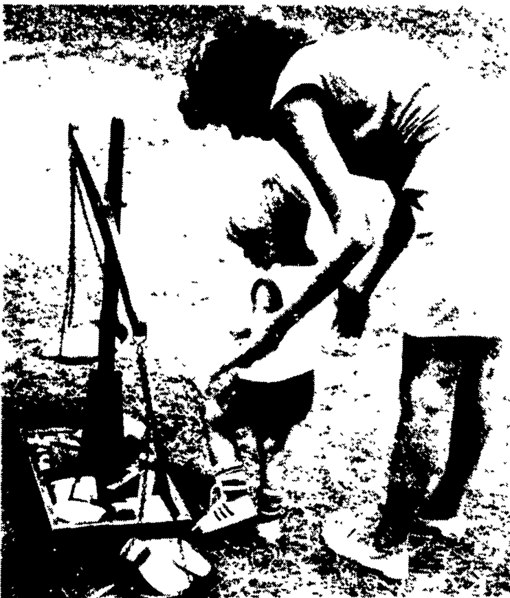
While Dad was off exploring the exhibits, this toddler decided to explore the puzzles and games at the Shaver's Creek exhibit.