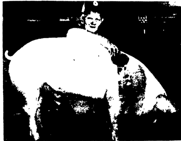
The grand champion market hog and heavy weight champion hog was owned and shown by Justin Carpenter.