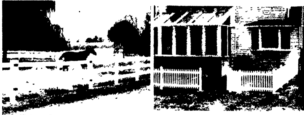
3-Rail Fence w/Gates "Never Need Paint"