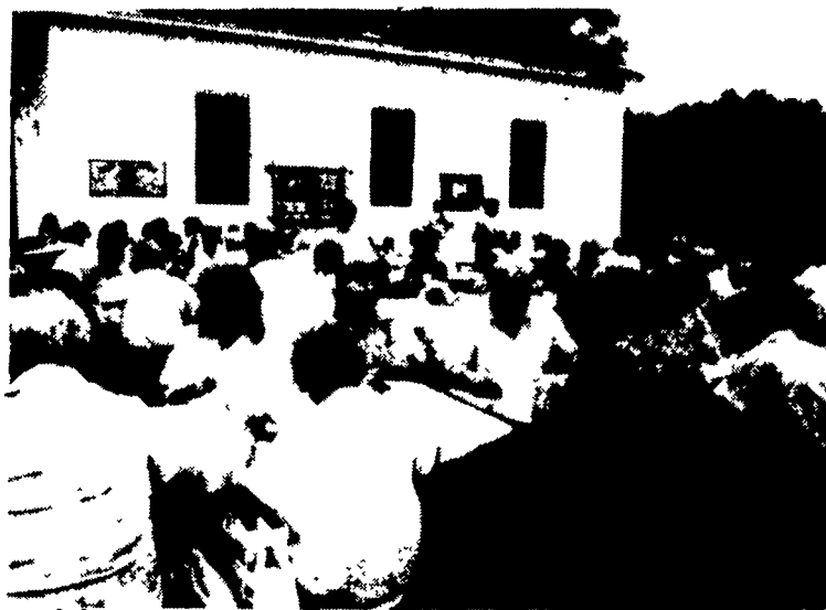
A large crowd enjoyed the delicious chicken barbeque prepared by the Bruch Creek Ruritans for those attending the National Red & White office dedication at Crystal Spring.