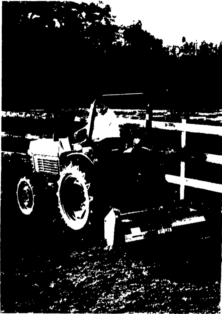
This small tractor features a three-cylinder, liquid-cooled diesel engine and an eight-forward-two reverse-speed transmission.

Kubota Tractor Corporation markets a complete line of tractors from 10 to 85 PTO horsepower, along with a variety of lawn and garden implements, compact construction equipment and a full line of consumer products. For more information contact Kubota Tractor Corporation at 550 West Arteria Boulevard, Compton, California 90220.