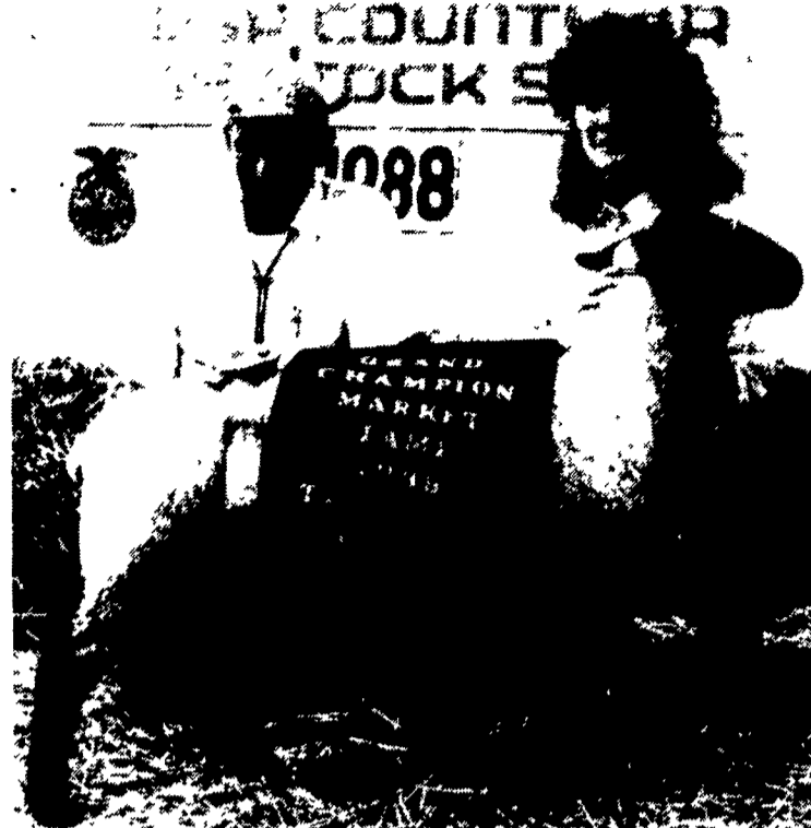
Clyde Beard, left, from the Cowanesque Valley Livestock Market purchased Tracey Rouse's grand champion lamb.

$1.50 per pound. First Citizen's National Bank of Mansfield purchased the 109-pound reserve champion market lamb from Cheri Bisel of Westfield for $4 per