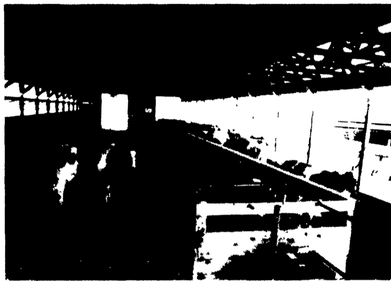
Freestall Barn - Interior View

A SPECIAL THANKS FOR ALLOWING AGRI-INC. TO DESIGN & BUILD YOUR FIVE MODERN DAIRY FACILITIES