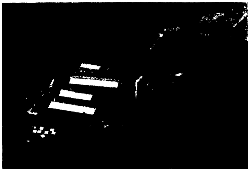
EM-TRAN Is A 60-Acre Farm With 300 Cows That Are Embryo Transfers

On Their New 40'x48' BUILDING Including Comfort Stalls And Milking Holding Areas