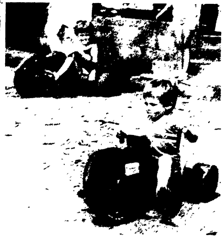
The large macadam driveway allows the cousins lots of room for motoring their Big Wheels.