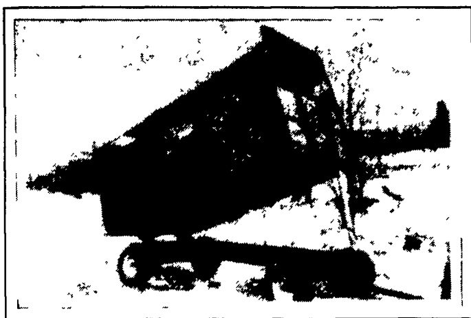
Model E-15 - Fast Box