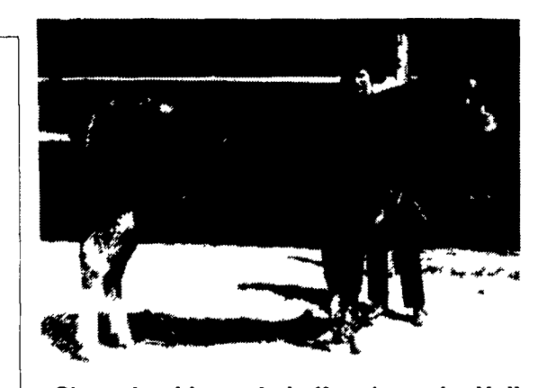
Champion Limousin heifer shown by Holly Mclaughlin