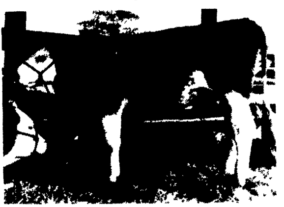
Champion Simmental helfer shown by Kim Hopple

through the entries to select champions in seven breed