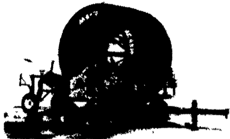
Three Axle Turntable Water-Reel

For Your Irrigation Needs Ag-Rain Traveler's From 3/4" to 5" I.D. Hose From 330' to 1300' Long We Have The Size Just For Your Needs