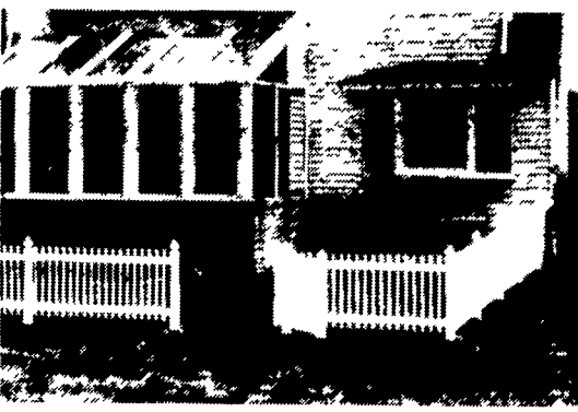
PVC Picket Fence