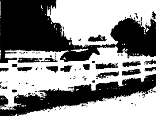
3-Rail Fence w/Gates Never Need Paint