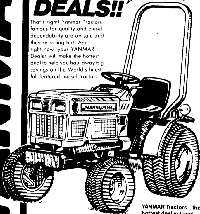
YANMAR Tractors the red hottest deal in town!

That's right! Yanmar Tractors famous for quality and diesel dependability are on sale and they're selling hot! And right now your YANMAR Dealer will make the hottest deal to help you haul away big savings on the World's finest full featured diesel tractors