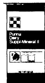
All Corn Silage and Grass