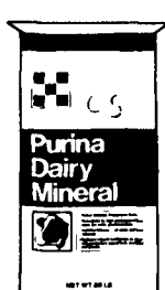
All Corn Silage