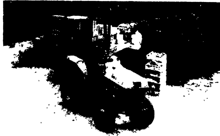
The L2550 F-2T tow tractor provides the lugging power and maneuverability necessary for farming, nursery, and construction.

The larger L2550 F-2T 2WD tow tractor with 29.5 HP provides 1,700-drawbar-pull-capacity and comes equipped with partially synchronized transmission and a manual shuttle shift. The shuttle shift allows the operator to change travel direction without searching for the reverse gear, thereby improving efficiency and reducing wear on the clutch and transmission. The L2550 F-2T also features wet disc brakes and an adjustable suspension seat for comfortable, efficient operation.