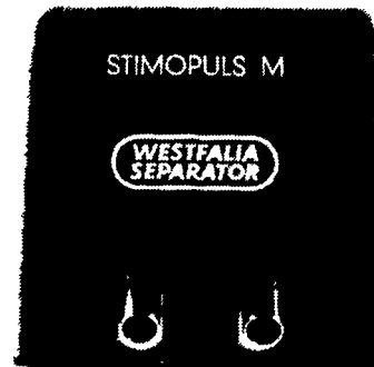
This pre-milking stimulator provides milking pulsation and monitors milk flow.

Greater operator efficiency, increased milk yields and increased profits. It's all here with the Westfalia high tech STIMOPULS.