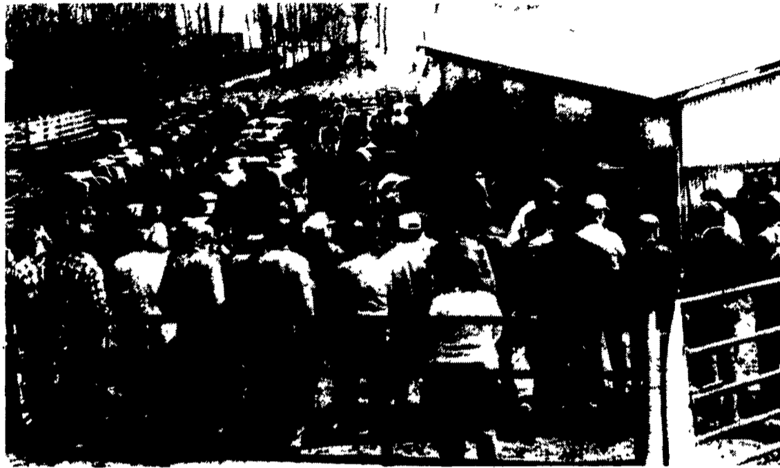
The 400-cow herd at Coldsprings Farms is reviewed by Lancaster Dairymen.