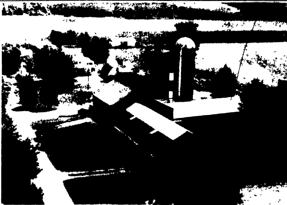
The Daniel Jones Farm, Stoneboro, Mercer county, was one of the nearly 100 farms so honored in 1987.

This exciting program promotes agriculture at its best. Broad public awareness of the