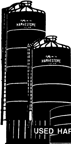
USED HARVESTORE® SILOS

Your Independent Used Harvestore® Dealer Serving All Of Ohio and Pa.