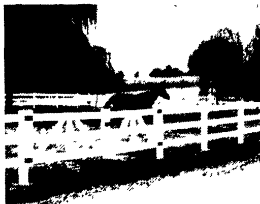
3-Rail Fence w/Gates Never Need Paint