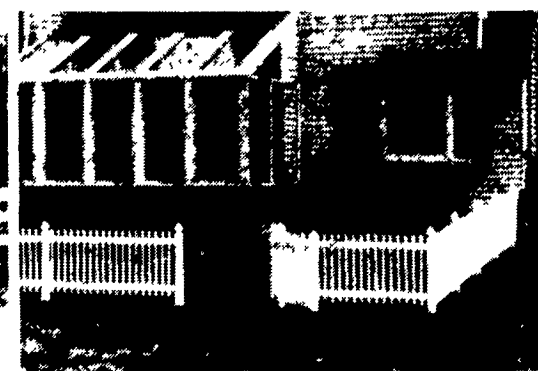
PVC Picket Fence