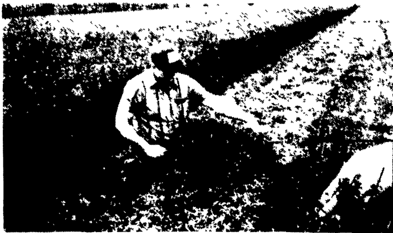
This alfalfa grown with Gro-Mor's complete feeding program shows amazing size and value at its cutting. This shows excellent stocking in the alfalfa field.

The petition asks the school board to 1) purchase a parcel of (Turn to Page A32)