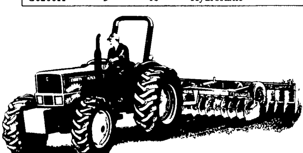
KUBOTA M SERIES TRACTORS