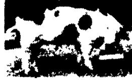
TA TUDOR - Sire of our 1986 PA Farm Show Grand Champion Bred Gilt and our 1988 Co Top Selling Third Place Bred Gilt