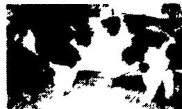
OV TRENDSETTER - Super Boar! He makes em Lean and Heavy Boned. Owned in partnership with Oakview Farms of Urbana Ohio