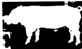
HSH PROFIT - Sire of Bone and Width. A Super Set of Gills and Boars Sell