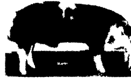
LC EVOLUTION - This Boar was purchased from Larry Crane of South Dakota for $2,500. He sired our First Place April Gilt at the 1987 Keystone Classic