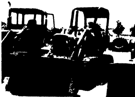
JD 450 Crawler Loaders Choose From 2 (2) At $11,500 or $380.65 Monthly