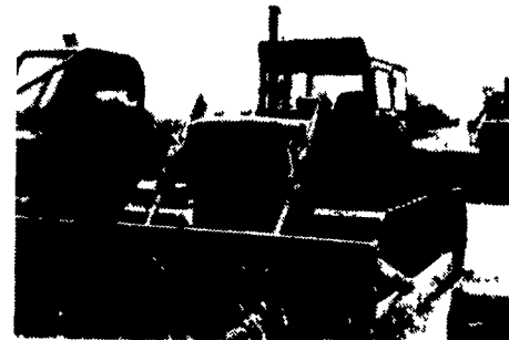
Cat D4D Powershift Dozers Choose From 3 $16,500 to $22,500