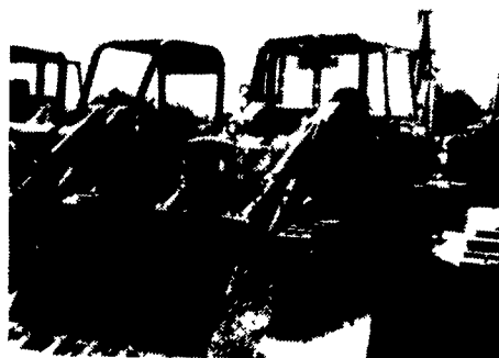
JD 450 Crawler Loader Backhoes Choose From 4 (1)- $14,500 (2)- $16,500 (1)- $19,500 Or *No Money Down Financing Available