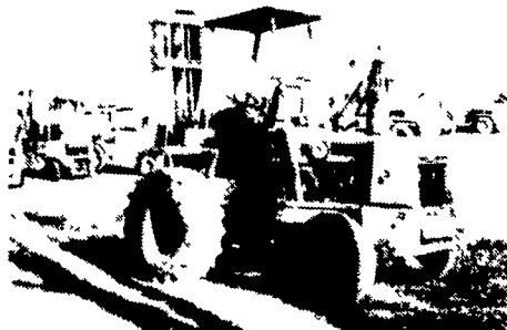
Case 584C Forklift, Low Hours $13,900