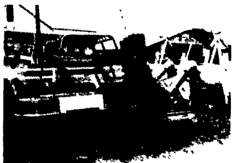
TCM 6000 Lb. Forklift, Air Tires $6,900

* FINANCING AND LEASING AVAILABLE TO QUALIFIED CUSTOMERS