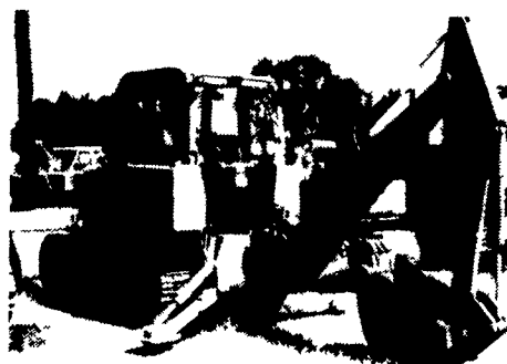
JD 555 Crawler Loaders Choose From 3 With Cab- $24,500 or $810.95 Monthly (2) With Cabs & Hoe Attachments- $27,500 or $910.25 Monthly