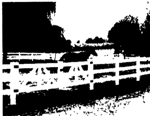
3-Rail Fence w/Gates Never Need Paint