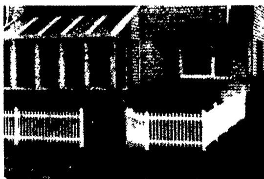
PVC Picket Fence