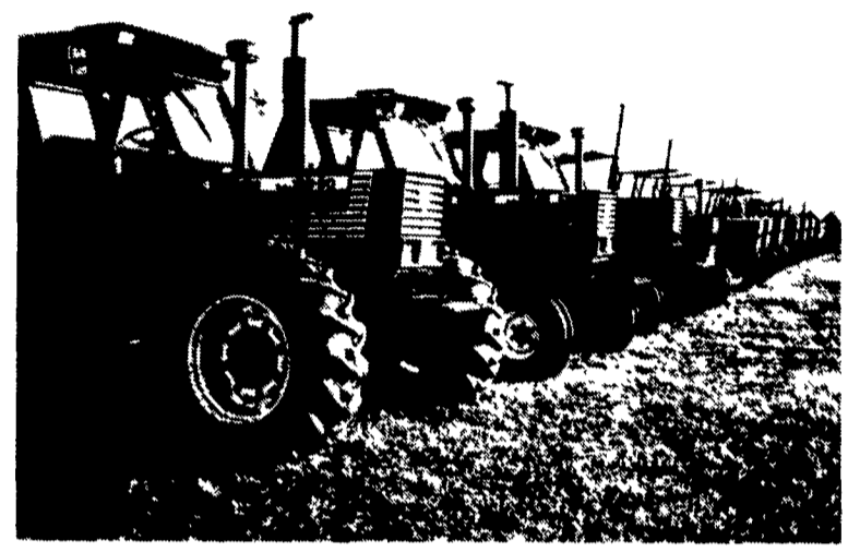
Good selection of Hesston Tractors 37-162 PTO HP in stock ready to go to work for you this spring.

Hesston Corporation a Member of the FIAT Group