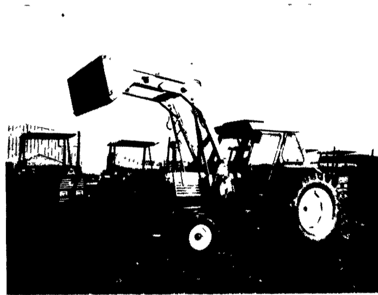
100-90 2WD, 15-speed synchronized transmission, cab, air, heat, w/L350 loader and 87" bucket Demo...$27,400.00