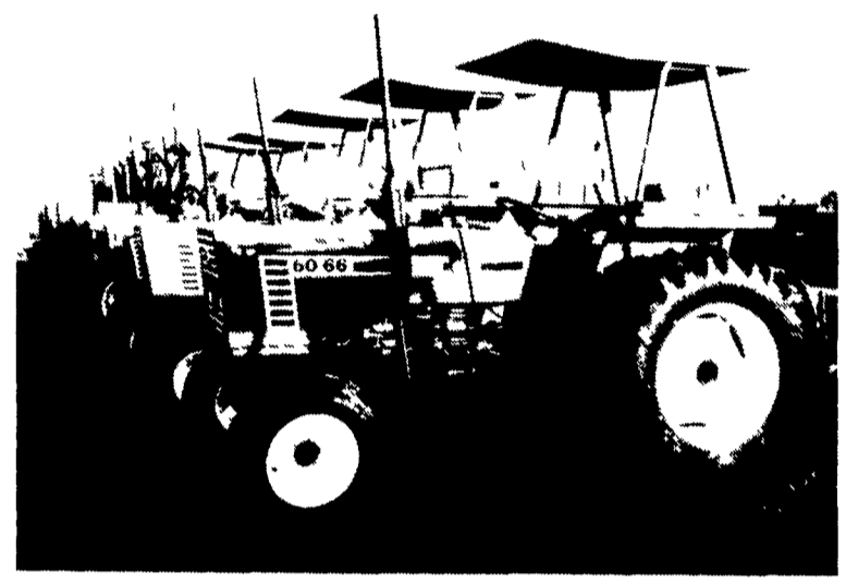
60-66 2 WD, 12-speed synchronized transmission, 9.5L-15 & 14.9x28 tires, ROPS, canopy, s/n 388612 List $19,584.00 19 hr. Demo Unit FIELD READY..... $13,900.00