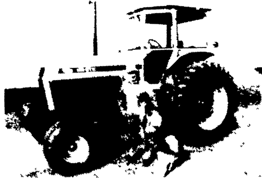
Leroy Oberholtzer, Manheim, Pa. purchased his White Model 120 in December 87. The Model 120 was one of 5 new tractor models introduced by White. "Repair service on other equipment, and good prices led me to look to G&D Repair when purchasing a new tractor."