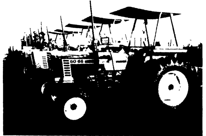
60-66 2 WD, 12-speed synchronized transmission, 9.5L-15 & 14.9x28 tires. ROPS, canopy, s/n 388612 List $19,584.00 19 hr. Demo Unit FIELD READY..... $13,900.00