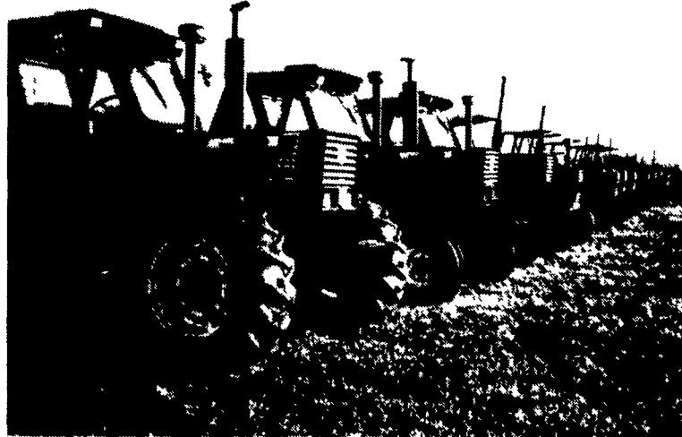
Good selection of Hesston Tractors 37-162 PTO HP In stock ready to go to work for you this spring.

Hesston Corporation a Member of the FIAT Group