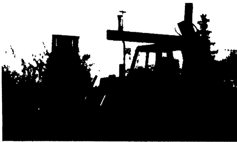
Some With Cab & Extenda-hoe

CASE 580C LOADERS See Us Now For New Arrivals... PRICED TO SELL