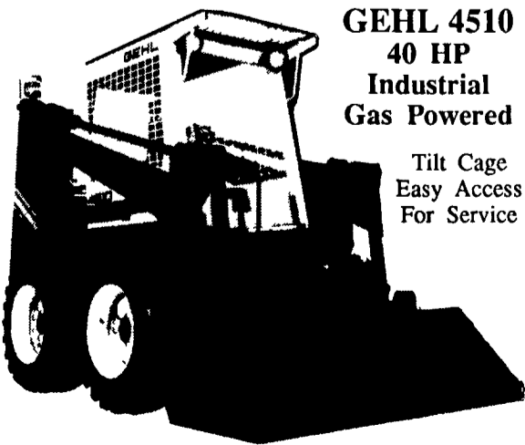
← 65" Wide w/65" Bucket, 10.00x16.5 Tires →