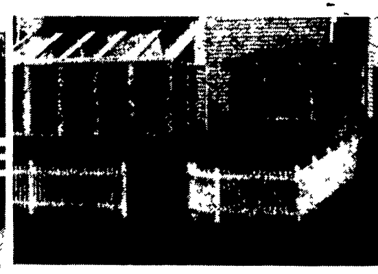
PVC Picket Fence