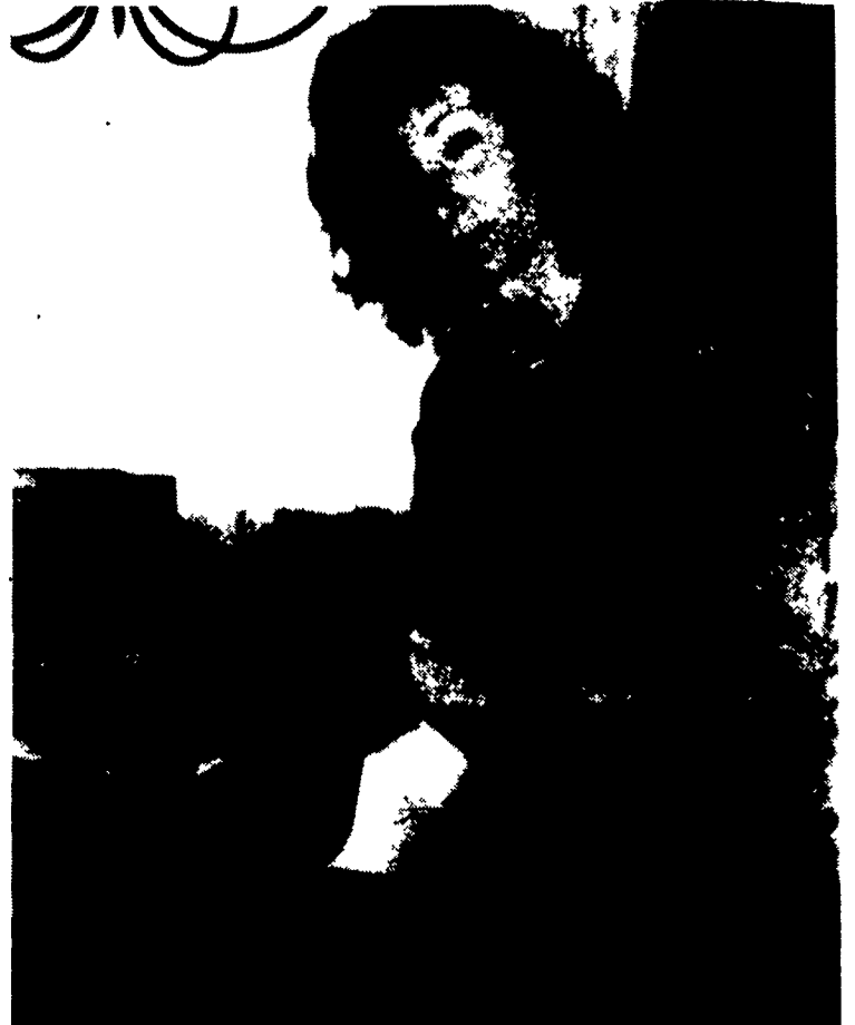
Sandra Paveglio demonstrates how farm show judges examine garments to determine whether or not they deserve a prize-winning ribbon.

In the end, the quality of the garment not the judge decides the ribbon status of the articles. Entries will be displayed from January 10 until noon on January 15.