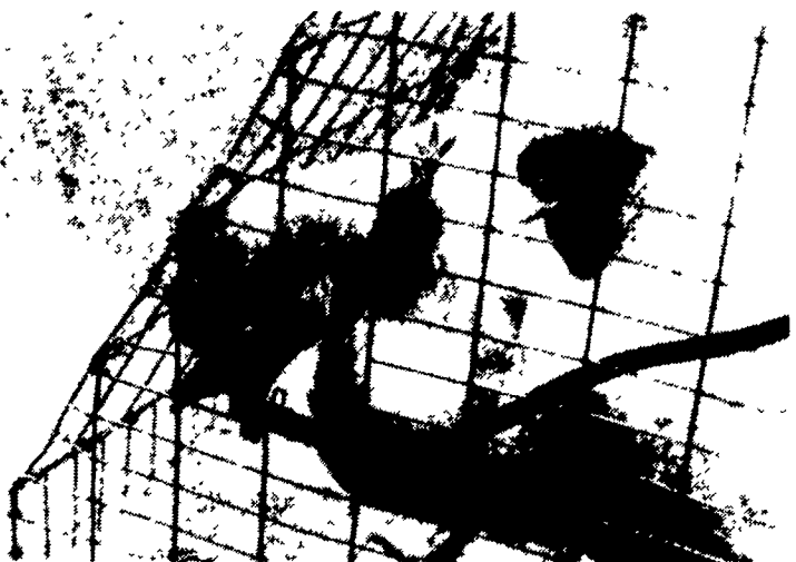
This watering system has more watering space per cup and has a self-cleaning mechanism.