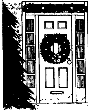
May your joys be many, as are our thanks to you.

(Based on copyrighted Outlines, produced by the Committee on the Uniform Series and used by permission. Released by Community & Suburban Press)