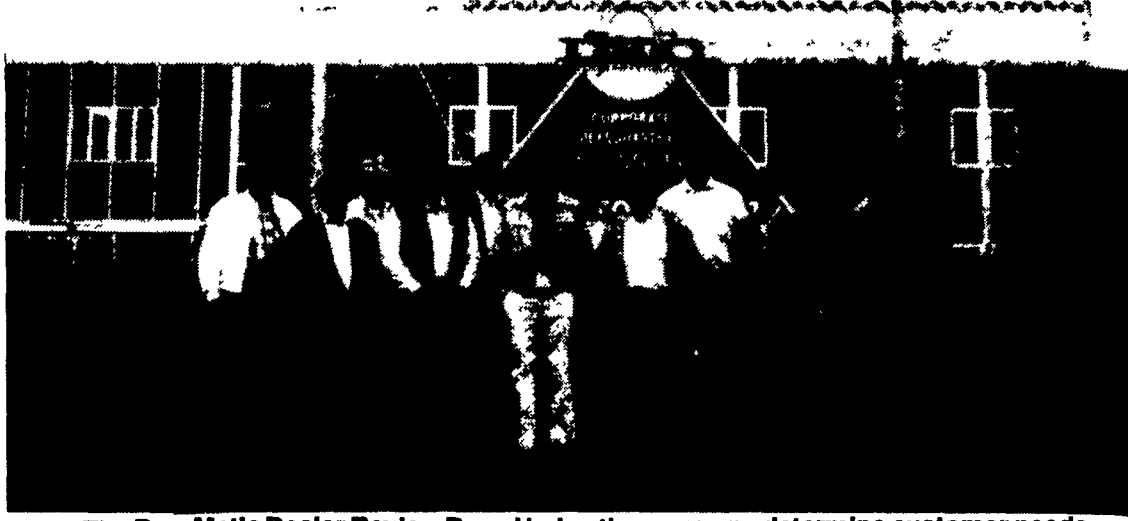
The Bou-Matic Dealer Review Board helps the company determine customer needs for the year.