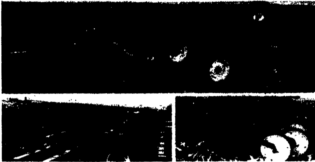
Tye Series V Grain Drill equipped with HydraLevel on-the-go coulters depth control and new E-Z Adjust presswheels. Simplified HydraLevel hydraulic system is controlled from the tractor. Coulters depth is adjusted while drill maintains its level setting. E-Z Adjust presswheels, available for all Tye Drills, feature a simple lever-type depth adjustment that will not freeze-up.