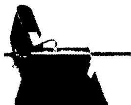
SUNNY PIG 2 2,200 to 4,400 BTU