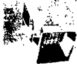
SUNNY PIG 1 1,000 to 2,200 BTU

Choose downgoing heat... Choose SBM brooders.