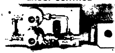
RGG + ST1 SEMI-AUTOMATIC CONTROL w/Thermostat

COMPLETE SYSTEMS & EQUIPMENT SALES FOR CATTLE, HOGS & POULTRY