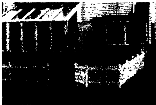
PVC Picket Fence