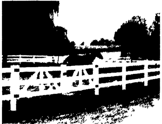
3-Rail Fence w/Gates 'Never Need Paint!'