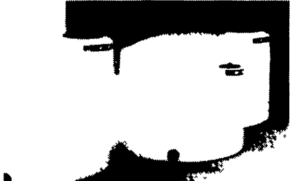
Norwesco tanks rugged, durable, built to last, with seamless construction