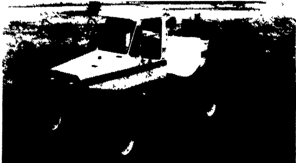
The Melroe Spra Coupe ... a high clearance sprayer that does everything but fly

At GVM, our customer comes first. From prompt delivery to top-notch personnel who take the customer's needs to heart.