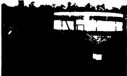
The economical GVM Auger Tender features a 5 ton capacity and a 304 stainless steel swivel sump and hopper