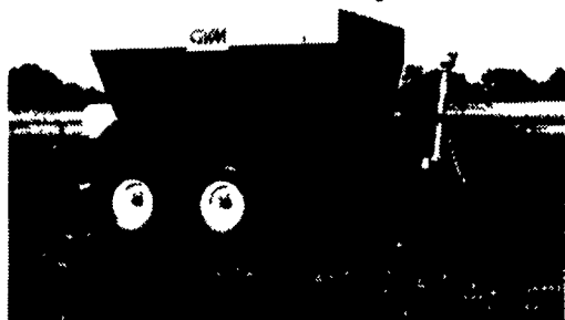
Spread both lime and fertilizer with the GVM DD Double Duty Spreader