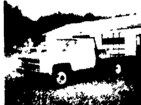
1986 CHEVY C30 With 8 1/2 ft. diamond plate flat bed, 350 4-speed, PS, PB, 34,000 miles, ex. cond. $9,950