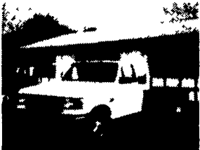
1987 FORD F350 Dual wheel, cab & chassis, 460 auto., PS, PB, dual tanks, 11,000 GVW, radial tires, 150 miles with factory warranty. $11,900