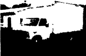
1986 CHEVY G30 14 ft. Duralite flat floor cube van, 350 Auto, PS, PB, with pull out loading ramp, 11,000 miles, like new. $12,900