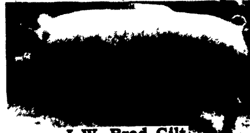
L.W. Bred Gilt