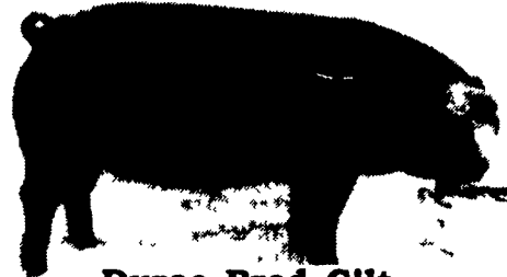
Duroc Bred Gilt

(If you cannot attend the sale we offer a free buying and delivery service, Your Satisfaction Guaranteed)