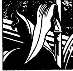
Tolerant to leaf and stalk diseases.