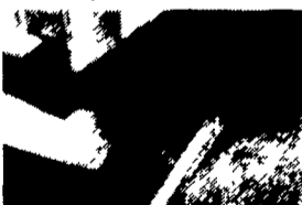
Summer till point

Today's heavy equipment causes severe soil compaction. Don't let it squeeze your profits. Put the two season conservation tillage companion to work, BLU-JET's Sub-Tiller II. Available in 3, 5, 7, and 9 shank units, 3 point or pull type, with shear bolt or flex trip design.