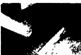
Fall till point