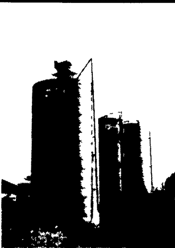
INDUSTRIAL SILO "COMPASS QUARRIES" Paradise, PA