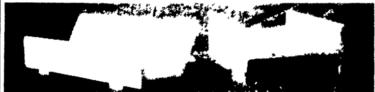
SLANT BACK J BUNK

You Spend A Lot Of Time And Money Producing And Storing Your Good Feed Crops. Don't Just "Get By" With A Feeding Bunk That Wastes Feed Or Is About Worn Out. Your Best Choice For A Feed Bunk Is Pre-Cast Concrete.