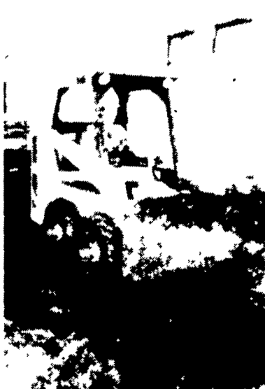
ASK YOUR DEALER to demonstrate new Bobcat models that feature a newly designed engine compartment providing easier, faster self-service from the rear. And for more operator comfort, try out the roomier, quieter cab.