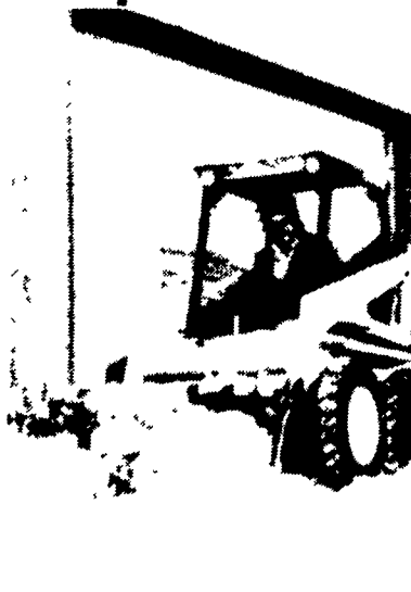
LET IT BLOW AND SNOW — it won't slow you down when you can haul out a Bobcat. Clean yards, driveways, around farm equipment, even in between buildings. Scoop, turn, lift, dump — it's a lot more than a snowplow.