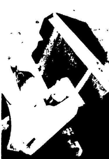
BOB TACH — FARMER'S FRIEND Stay aboard to change attachments. Just disengage levers, drop off the bucket, move on to another attachment, hook up solid and get on to the next chore.