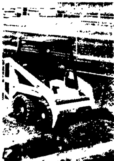
HANDLE ALL THOSE TIRE-SOME JOBS quickly in any dairy, hog, beef or horse barn or yard. That's what the Bobcat was originally designed for. But now, with several attachments, it's a multi-job machine.