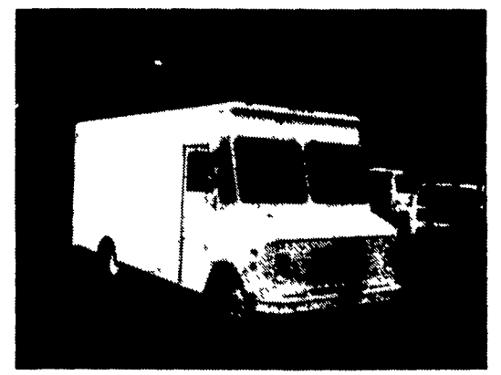
1987 ISUZU NPR WALK-IN VAN (Bread Box Body) 15 Ft. Aluminum Body 86''w x 81''h (inside). This Truck Must Be Sold! Any Reasonable Offer Will Be Seriously Considered! Call Us Immediately