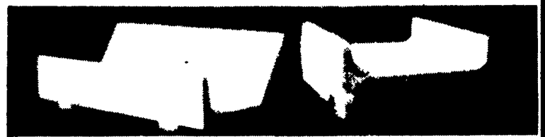
SLANT BACK J BUNK

You Spend A Lot Of Time And Money Producing And Storing Your Good Feed Crops. Don't Just "Get By" With A Feeding Bunk That Wastes Feed Or Is About Worn Out. Your Best Choice For A Feed Bunk Is Pre-Cast Concrete.